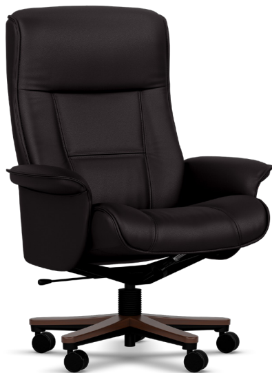
Nordic Office 21 W77 x D77 x H109-116 (M)